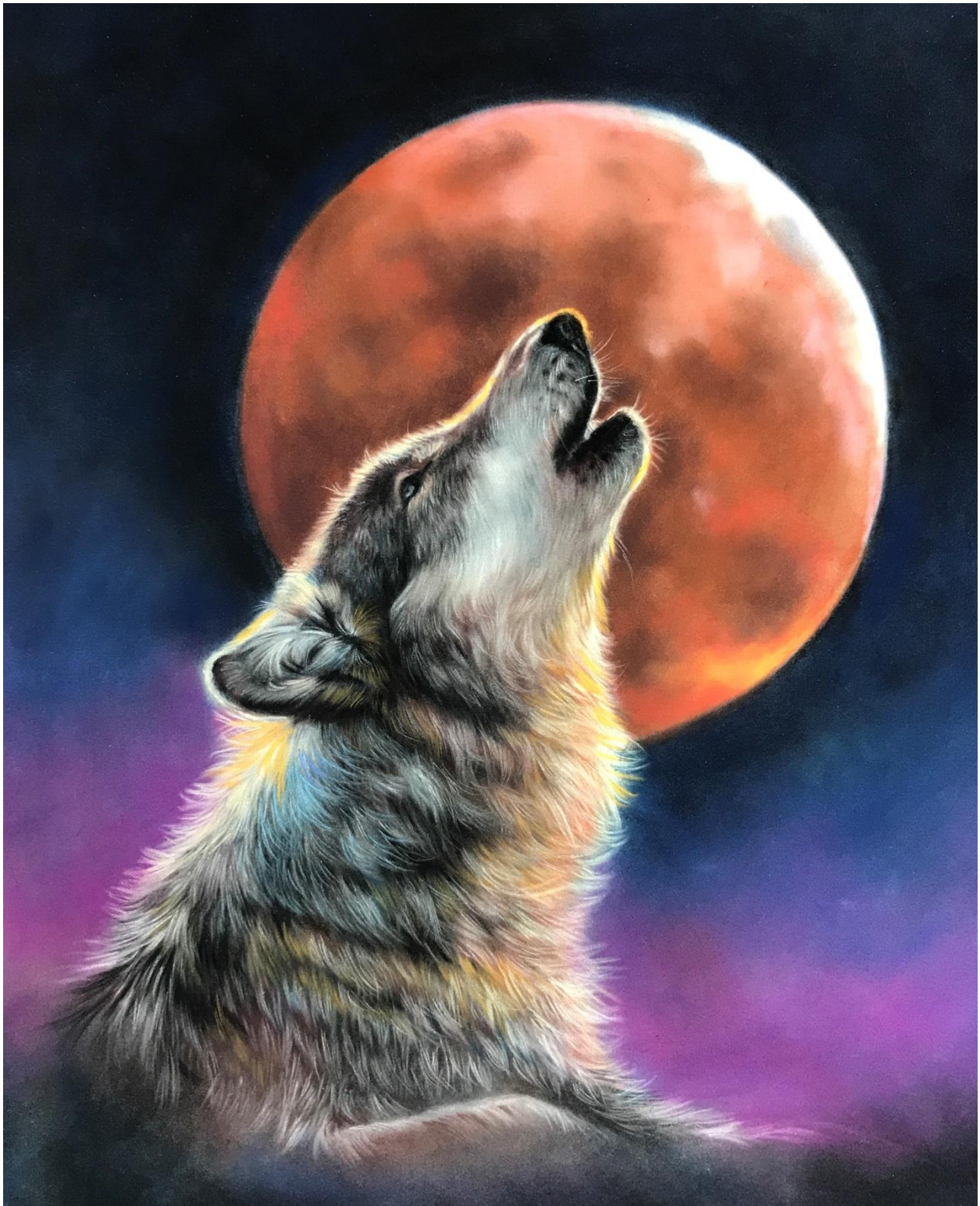
Howling Wolf with the Blood Moon